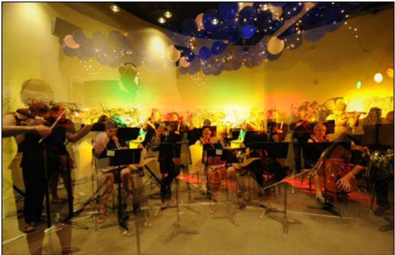
The Casse-Tête Festival Ensemble performing Terry Riley's “In C,” 2013.